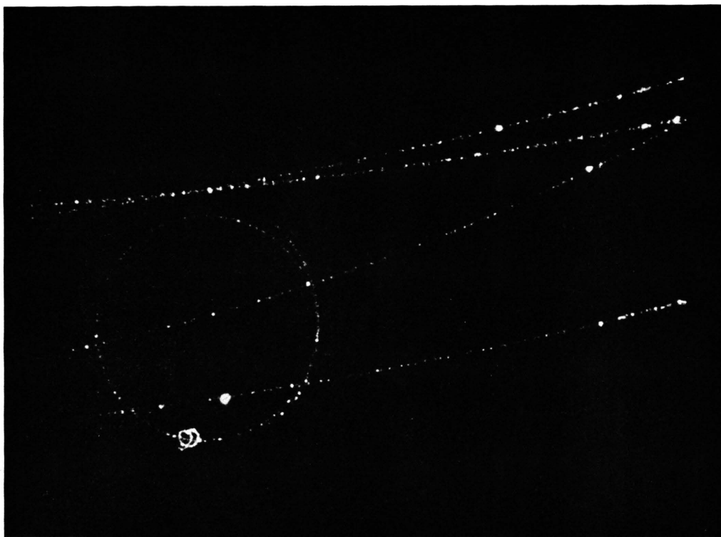
Fig. 1. Four 500 MeV positrons passing through a streamer track chamber set up in a magnetic field. One COMPTON electron.

momenta and spatial angles at the vertex of the particles.